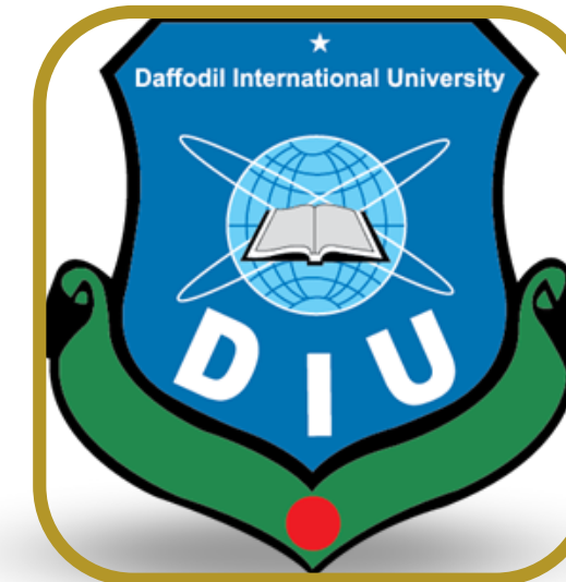
Daffodil Int. University